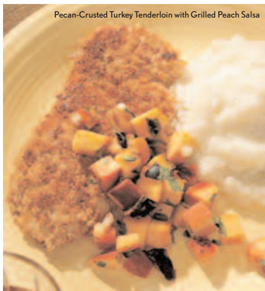
Pecan-Crusted Turkey Tenderloin with Grilled Peach Salsa

(Clockwise from above): Peaches ripening in the Georgia heat at the Pearson Farm make a tart-sweet barbecue sauce to accompany pork chops. According to Al Pearson (below, reaching for a Flame Prince peach), "In a good year one tree will produce between 100 and 150 pounds of peaches." The Pearsons also grow pecans, which make a tasty, crunchy crust for turkey paired with a zesty grilled peach salsa. Peaches turn to glowing jam with just a couple of ingredients and a little time.