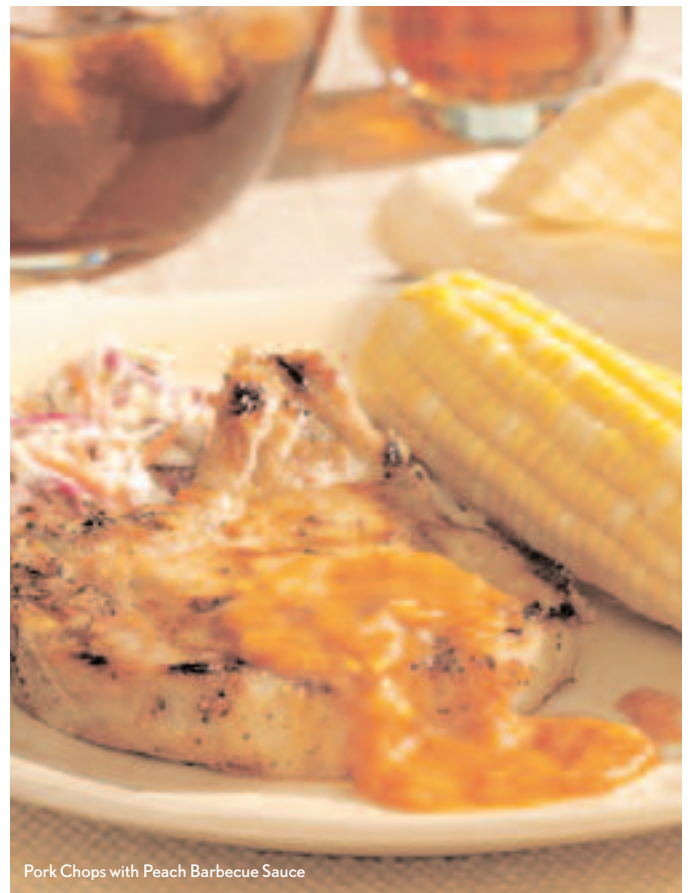
Pork Chops with Peach Barbecue Sauce