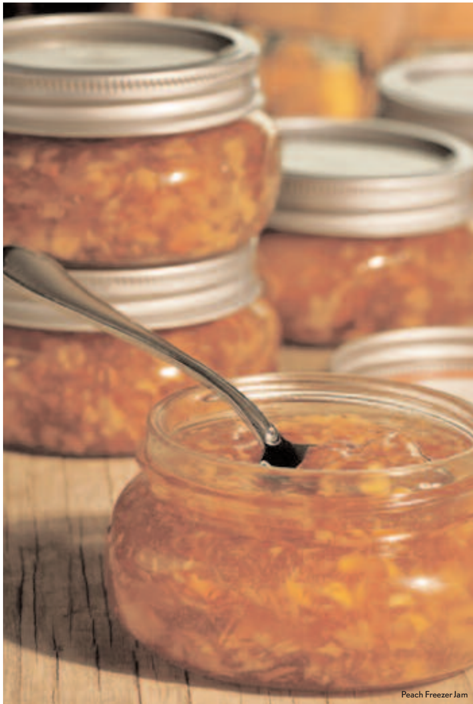
Peach Freezer Jam